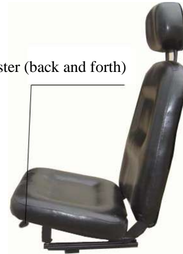
Seat Adjuster (back and forth)

You can adjust the location of Seat by moving the hand lever under the cushion. You can move the hand lever right, and then move to the place necessary and loosen the hand lever. Attention: please resume the location of the hand lever.