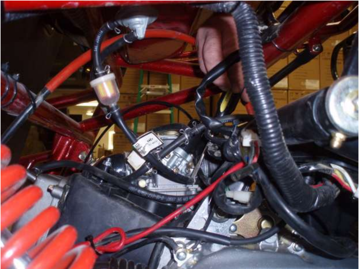
Figure 1: Fuel line hookup.