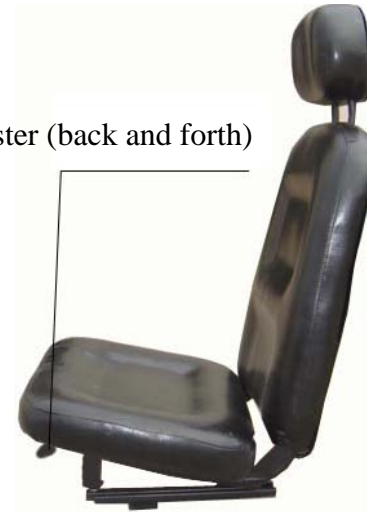
Seat Adjuster (back and forth)

You can adjust the location of Seat by moving the hand lever under the cushion. You can move the hand lever right, and then move to the place necessary and loosen the hand lever. Attention: please resume the location of the hand lever.