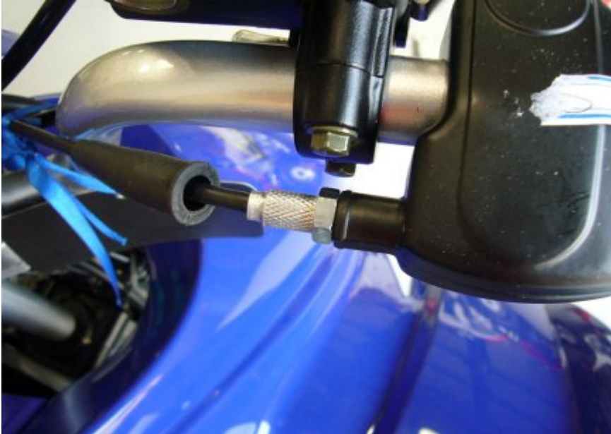
fig01-step15-Throttle cable free play adjustment

15. Inspect throttle, brake, and clutch cable free play adjustments. Confirm that all locking nuts for cables are tight to avoid loss of adjustment. See Owner's Manual for adjustment procedure and specs.