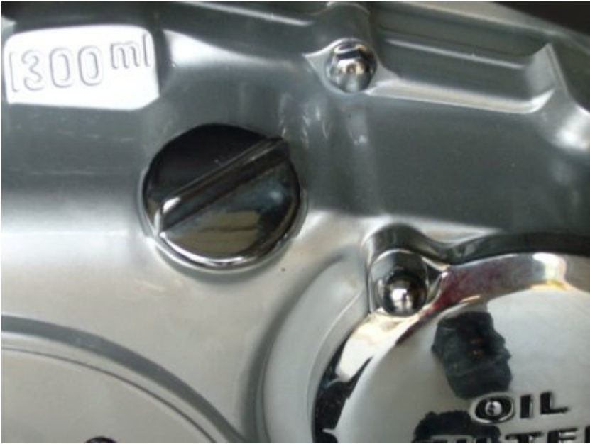
fig18-step04-Oil fill port