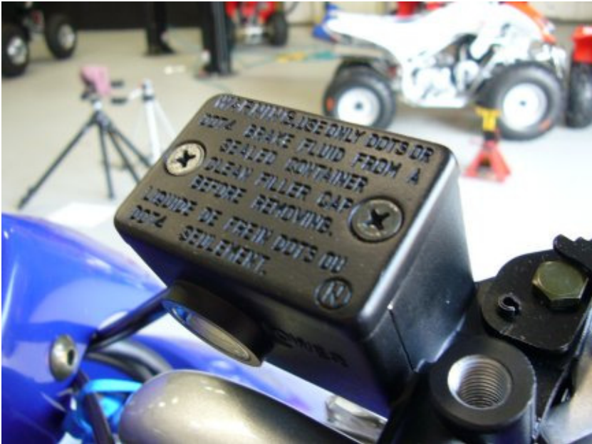
fig03-step18-Front brake fluid reservoir