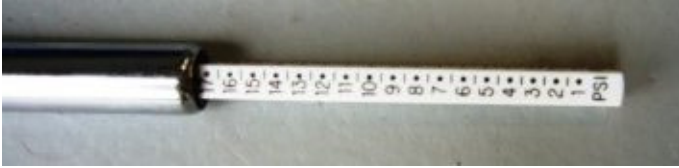
fig01-step04-Air gage with .5 pound increments

smaller than 1 PSI to complete this step. Improperly inflated tires can cause loss of control.