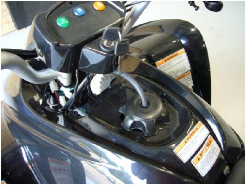
fig01-step18-Fuel vent hose