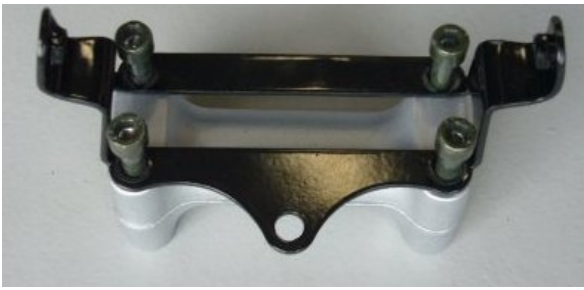
fig01-step08-Handle bar bolts