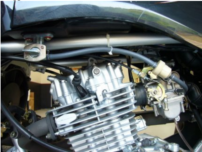
fig10-step01-Fuel line routing

10. All ATV's are shipped with the fuel lines unhooked. Connect the fuel supply line, coming from the fuel tank, to the fuel inlet port on the carburetor securing it with the spring clamp provided on the fuel line. Make sure the fuel line is routed in a way to avoid kinks and to allow for the proper gravity feed from the tank. Do not run the fuel line near any part of the exhaust or hot section of the engine and take care to tuck it in away from the rider's feet and legs so that it cannot be snagged.