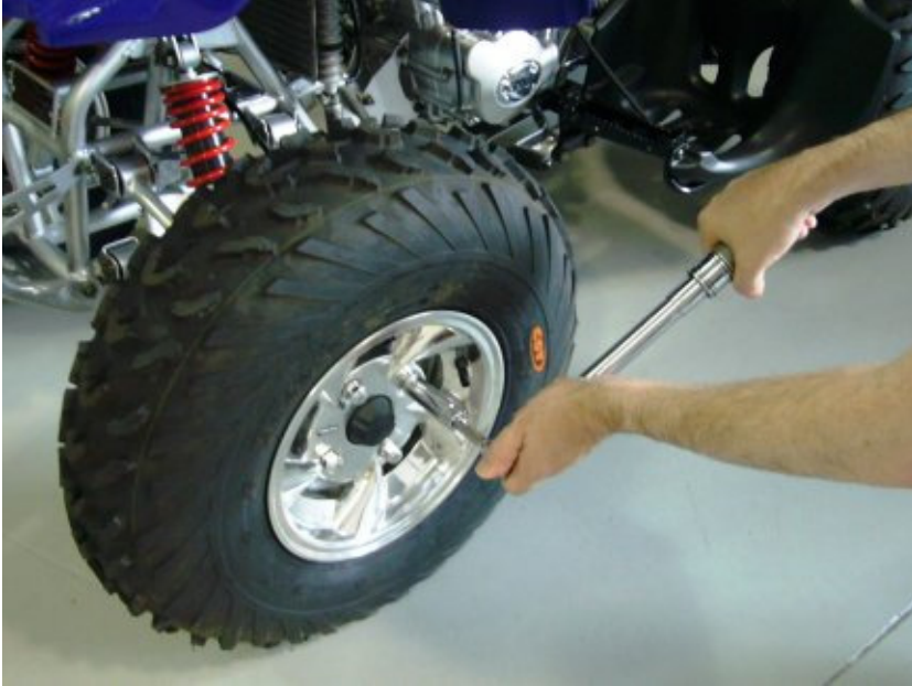
fig01-step07-Final torque procedure

7. Follow the same procedures outlined in steps 3 and 4 for inflating tires, installing center caps and mounting wheels on the rear of ATV. When finished installing wheels carefully lower ATV, release parking brake and roll off metal shipping frame onto flat, level surface. Reset the parking brake and perform the final wheel torque procedure. Torque all lug nuts to the proper spec using a torque wrench with the appropriate increments. Proceed in a star or criss cross pattern to assure uniform torque results.