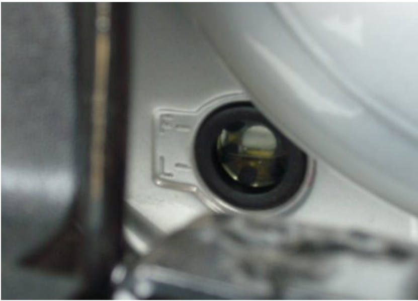
fig18-step05-Oil site glass

19. After ATV is started, closely inspect for any fuel or oil leaks. Confirm parking brake holds adequately and test each gear selection for proper indication on center console.