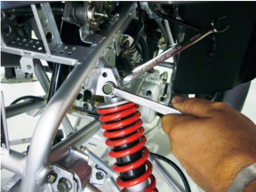
fig02-step03-Upper shock mounting