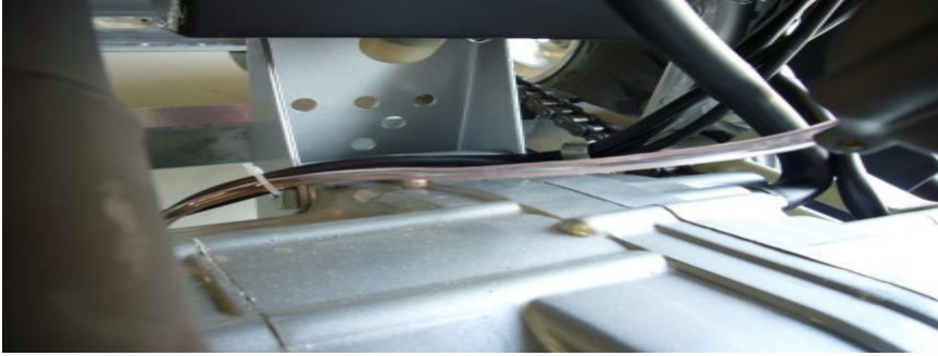
fig11-step01-Fuel drain hose routing

carburetor at the fuel bowl to assure that it is free of kinks and is clamped or tie wrapped into place. This hose should always be heading in a downward direction. See that the drain screw is seated in the closed position before adding fuel.