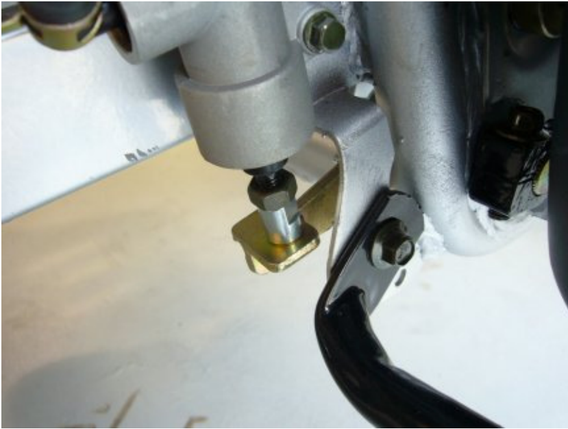
fig02-step15-Rear brake free playadjustment

16. Inspect all other critical nuts and bolts to see that they are secure even if you did not install them.