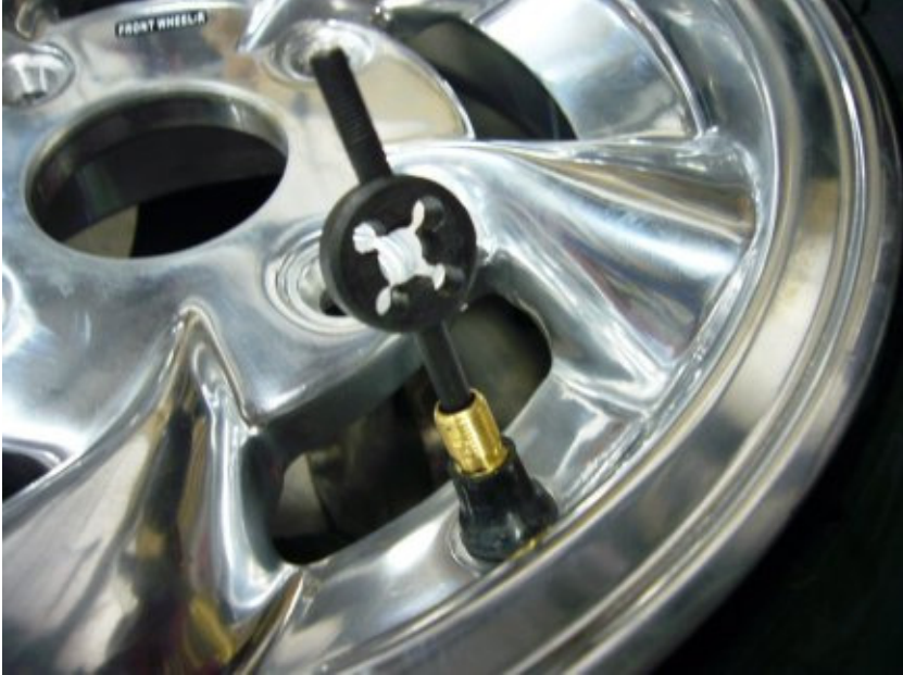
fig02-step04-Valve core tool

Use the valve core tool supplied with the ATV tool kit to tighten the valve core in each valve stem before attempting to add air.