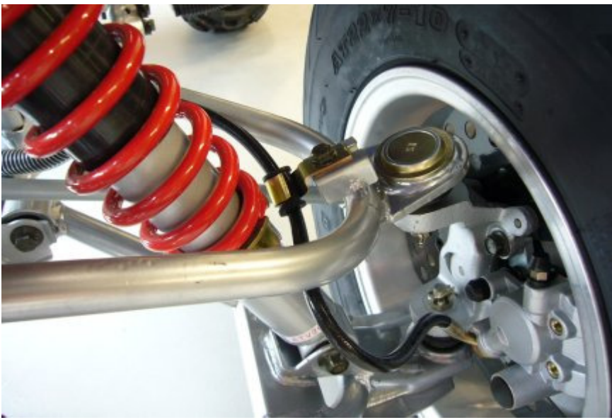
fig01-step14-Example of correct brake hose routing

15. Inspect throttle, brake, and clutch cable free play adjustments. Confirm that all locking nuts for cables are tight to avoid loss of adjustment. See Owner's Manual for adjustment procedure and specs.