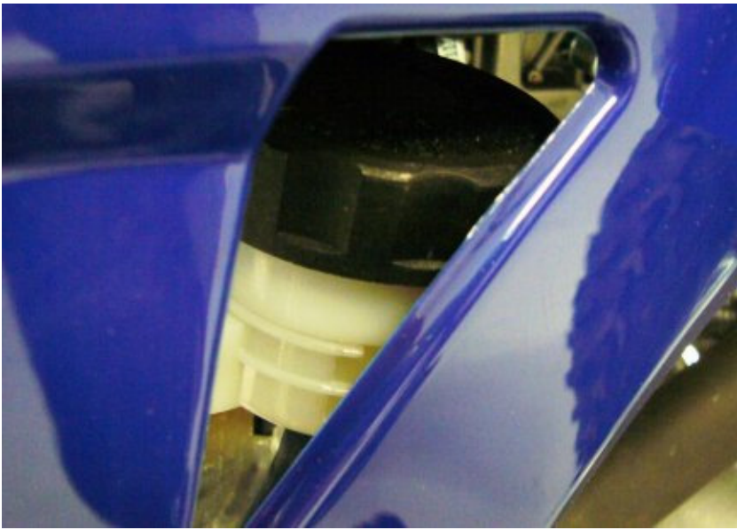
fig04-step18-Rear brake fluid reservoir