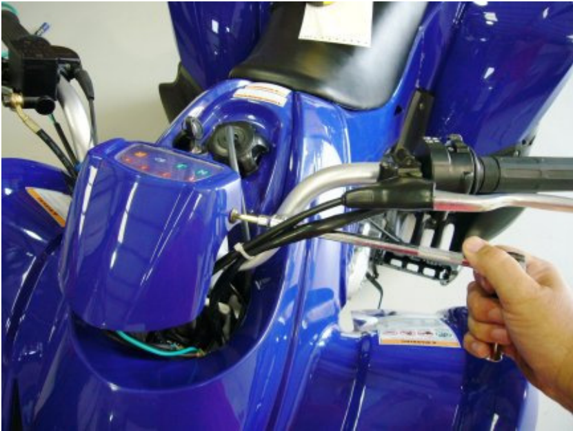
fig02-step09-Light console mounting

Connect the wiring harness connectors from the ATV main harness to the connectors for the indicator lights. Make sure that wiring colors of both halves are matched when connecting. NOTE: On some models it is possible to inadvertently switch two of the connectors because they are identical and will interchange. The wiring colors must be matched at the time you connect these to avoid incorrect information from being displayed on the light console.